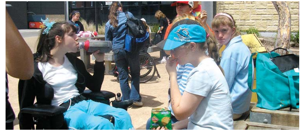
Lunch in Katoomba