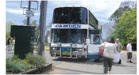
The coach prepares to depart