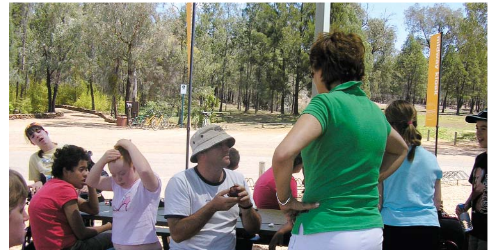
Lunch at the Zoo