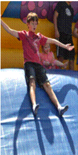
Fun at the Fair