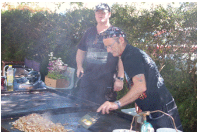
Two of our dads cooking for the ever-popular barbecue stall at the Fair

A reminder: students do not need to be in all the new uniform items until the year commencing 2014.